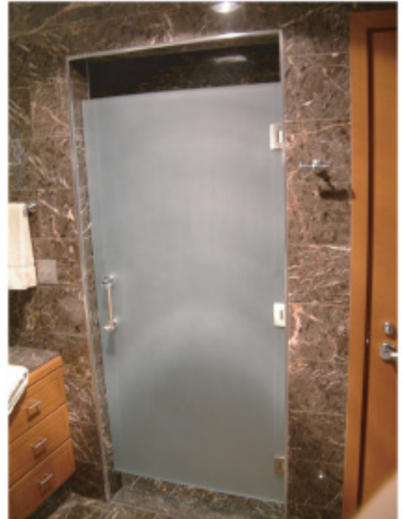
Solid blast single shower door with wall mount hinges.

Show more glass using top and bottom mount hinges that allow More glass to show and call for fewer cutouts compared to the Side-mount method. The hinges would mount to the header and Floor or the ceiling and floor using a pivot rather than a hinge. Add a finger pull cut-out to reduce hardware and get a cleaner look.