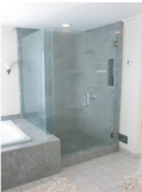
Euro shower enclosure with no frame for floating appearance.