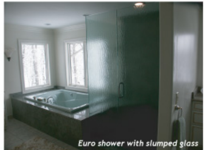
Euro shower with slumped glass