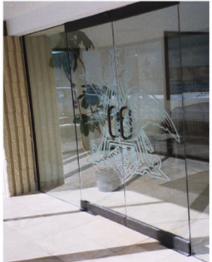
Glass entry system with sidelight and custom logo sand shaded and centered on two doors. Anheuser Busch corporate offices.

Include sliding or swinging doors, as well as stacking or bi-fold panels. Any one of our trained staff can assist you with your project, from choosing hardware such as pivots, rails and patches to hole placement, weight bearing supports and decorative hardware. We follow all tempering regulations, glass thickness, hole and hardware placement specifications to ensure a quality product that will last long and look great. Knowing safety standards is just one of the many benefits to working with CUDA architectural glass. We can help you design and develop a system that will be ready to install and fit the character of your application. Our in-house engineers will consult, work with and for you during your order. Since no two orders are alike we pay close attention to the detail, making your project an individual piece of architecture. We can walk through the process with those who are looking for a professional opinion or simply listen and produce exactly what the client wants.