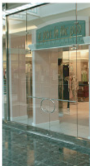
Mall entries for Bang & Olufsen and A Pea in The Pod